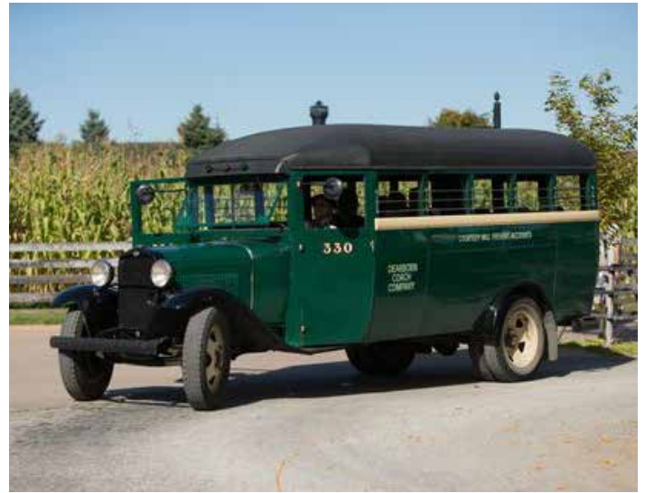
1931 FORD MODEL AA BUS